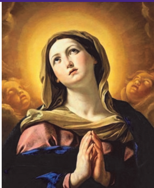
The Immaculate Conception Of The Blessed Virgin Mary-December 8, 2016

December 4, 2016 The Second Sunday Of Advent